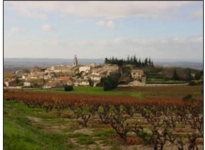
The Village of Visan

The land around Visan was once property of the Knights Templar and later in 1317 it became papal land. François recently modernized the winery which