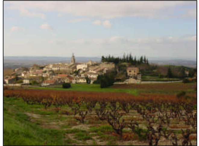
The Village of Visan