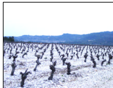
The chalky, white vineyards of Barroubio in AOC St-Jean-de-Minervois.

northeastern corner of Minervois. It is one of the few appellations where one can see exactly where the appellation begins and ends with the naked eye. The appellation consists of a very defined strip of bright white limestone where the Muscat Blanc à Petits Grains is the only grape variety permitted. Within the space of a few feet one can see the soil change dramatically from white to red, which denotes the boundary of the appellation. The sandy, clay-rich red soil is where the red grapes that produce AOC Minervois Rouge grow. In Saint-Jean de Minervois, the extremely chalky soil and high altitudes (Barroubio's vineyards are at 300 meters above sea level) produce an exceedingly complex and structured Muscat. Maximum yields for the Muscat are 28 hectoliters per hectare, although Domaine de Barroubio's miniscule yields are often half of that. There are only six producers that estate-bottle in this tiny appellation. The one cooperative still produces 75% of the wine in Saint-Jean de Minervois.