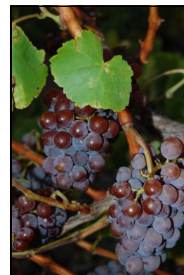
Grenache Gris grapes on 60 year old vines at Clos Serre Romani

50% Grenache Gris, 25% Maccabeu, 20% Grenache Blanc 5% Carignan Blanc